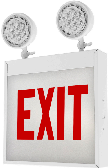
City of Chicago approved LED Combo Exit sign with steel housing and glass face