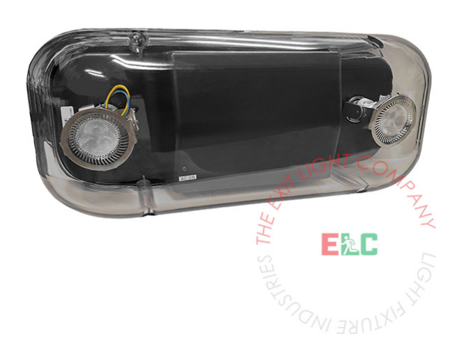
The EL4X Series is not only ideal for wet locations, its durable design is also resistant to corrosive atmospheres and harsh environments.